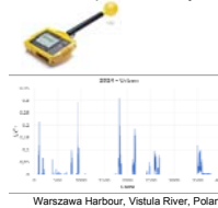
Warszawa Harbour, Vistula River, Poland